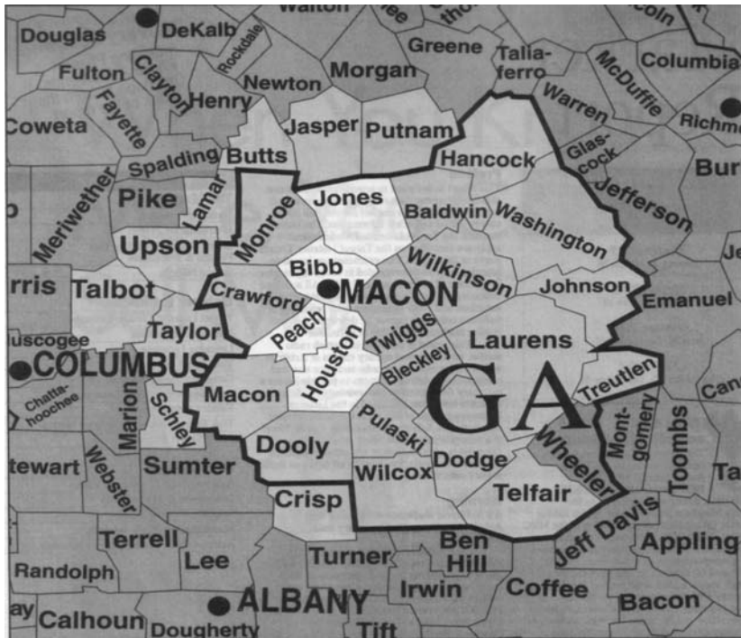
Map and population estimates are published by 2003 Arbitron Inc. and are based on Census 2000 data, updated and projected to Jan. 1, 2003 by Claritas, Inc.